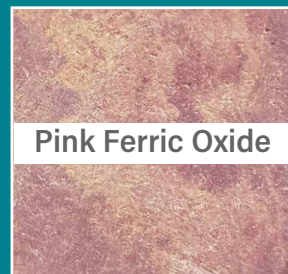
Pink Ferric Oxide