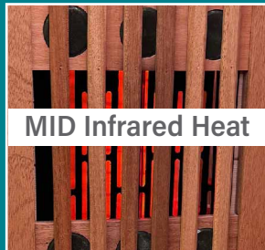
MID Infrared Heat