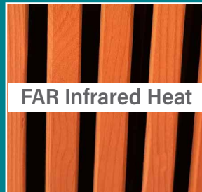
FAR Infrared Heat